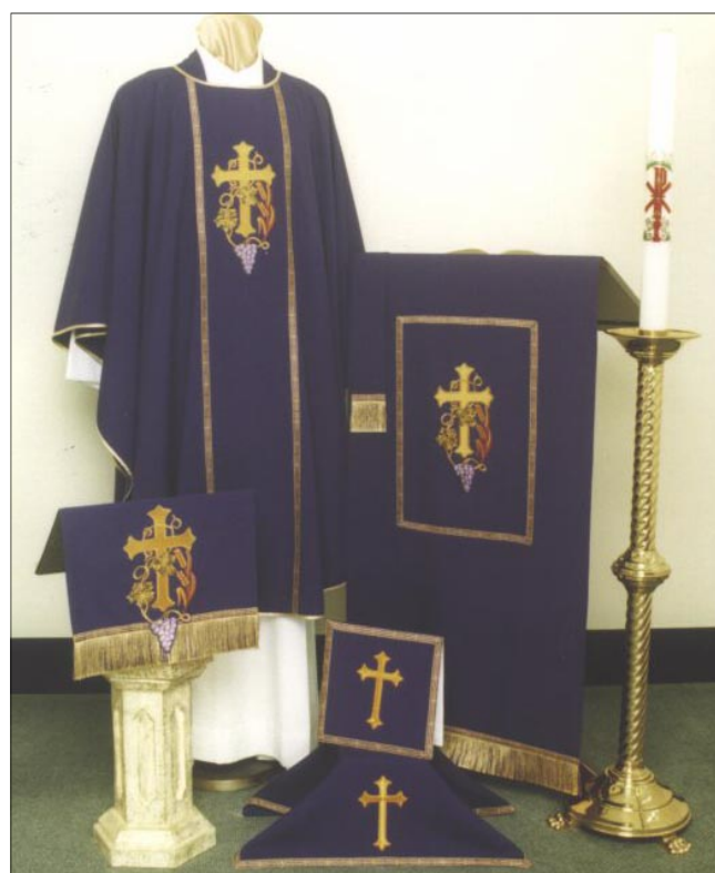
A set of vestments and furnishings incorporating the No 26 Wheat and Grape, and the No 6 Fleury Cross appliques.