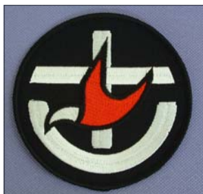
No 17. U.C.A. Emblem Sizes: 4.5" or 6" diameter.