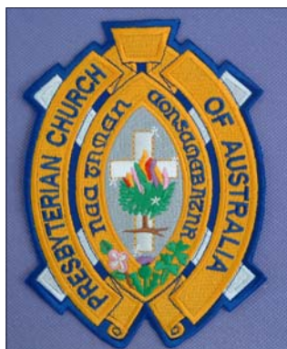
No 16. Presbyterian Emblem Sizes: 4" x 3" and 6" x 4.5".