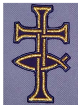
No 31. Cross And Fish Gold lurex on white, green, violet or red background. Size: 4.5" x 2.5".