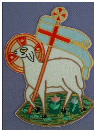
No 19. Agnus Dei Multi colored design on white background. Sizes: 5.25" x 3.75" and 7" x 5".