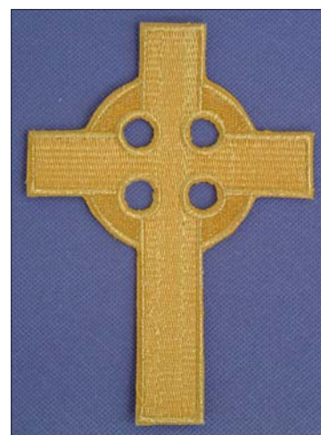
No 18 Celtic Cross Gold or silver lurex or gold rayon. Size 6" x 4".