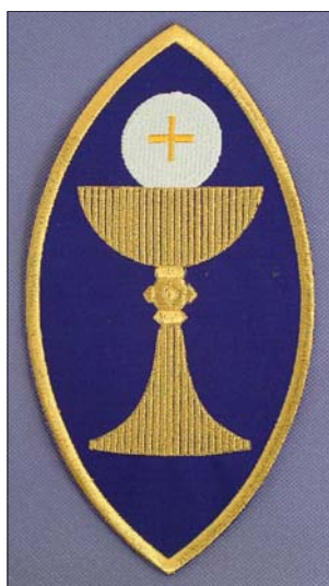
No 33. Chalice And Host Gold lurex or rayon on white, green, violet or red background. Size: 9" x 4".