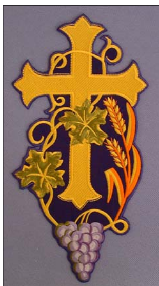
No 26. Wheat And Grapes on Fleury Cross Gold rayon on backgrounds of white, green, violet or red. Size: 11" x 6".