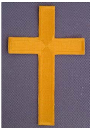
No 25. Simple Latin Cross White or gold rayon or gold lurex. Sizes: 6" x 4", 9" x 6", or 11" x 7".