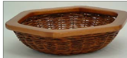
Wicker Collection Plates

Quality 28cm/11" diameter hand turned NZ Rimu with plush felt tray pad.