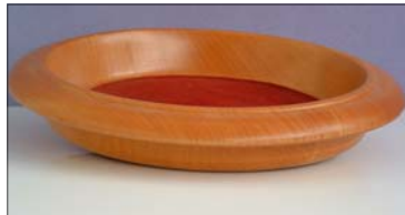
Wooden Collection Plate

Blue, red or green velvet bag on 14cm/5.5" diam. rigid frame top opening. Mahogany handles.