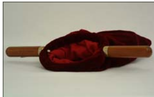
Alms Bag 2

Hand carved from a single piece of NZ Rimu, 14cm/5.5" diam. opening with red or blue velvet bag.