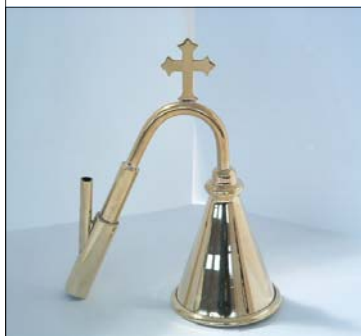
Brass Candle Extinguisher

Incorporating a taper holder and attached cross. Polished brass or wooden poles available also pew/wall bracket and floor socket to fit.