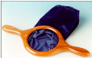
Alms Bag 1

Hand carved from a single piece of NZ Rimu, 14cm/5.5" diam. opening with red or blue velvet bag.