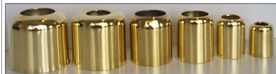
Brass or Pyrex

Decorative and practical, the savers extend the life of the candles and prevent dripping. Brass savers are not lacquered, glass are heat resistant. Available in the following sizes, 21mm, 25mm, 28mm, 32mm, 35mm, 38mm, 44mm, 51mm, 54mm, & 65mm.