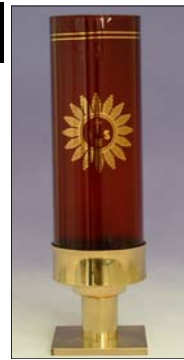
Table / Altar Lamps

Gold edged ruby glasses for use with sanctuary candle. 9"/ 23cm and 4.5"/ 11cm high.