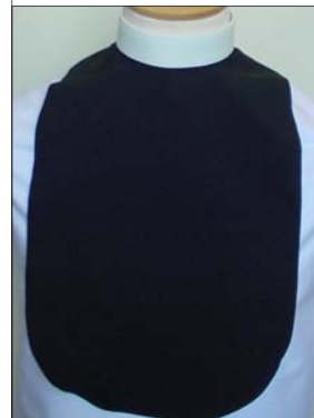
Full Collar Style

Available in both the traditional plain neckband style for use with the full clerical collar (sold separately) and the Comaco Tonsure style with comfort collar. Produced in light weight black fabric, the bib stock measures 12" in length (pictured), the vest stock measuring 21". Other colours available on special order.